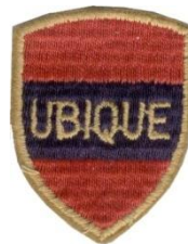
SOUTH AFRICA ENGINEERS cloth flash