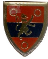
3 FIELD ENGINEER SQUADRON