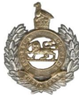
RHODESIAN CORPS OF ENGINEERS, pre independence