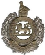
RHODESIAN CORPS OF ENGINEERS, pre independence