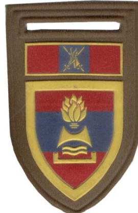
2 FIELD ENGINEER REGIMENT with DIRECTORATE ENGINEER COMMAND bar embossed shoulder badge