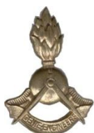
GENIE-ENGINEERS, gilding metal worn 1959-1970