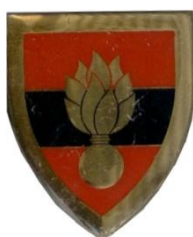
SCHOOL OF ENGINEERS