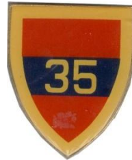
35 ENGINEER SUPPORT UNIT