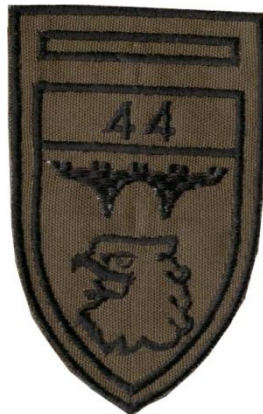
44 PARACHUTE BRIGADE ENGINEER SQUADRON cloth shoulder badge, work dress, obsolete