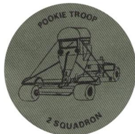
2nd SQUADRON COMBAT ENGINEERS, "POOKIE TROOP" From the early 1970's