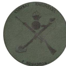
2nd SQUADRON COMBAT ENGINEERS COUNTERMINES From the early 1970's