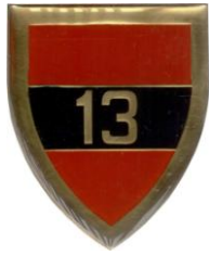
13 FIELD ENGINEER SQUADRON