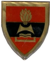
2 FIELD ENGINEER REGIMENT