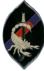
Pocket badge SPECIAL OPERATIONS BRIGADE ENGINEERS