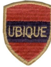
SOUTH AFRICA ENGINEERS cloth flash