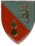
SOUTH WEST AFRICA 91 GENIE ESKADRON