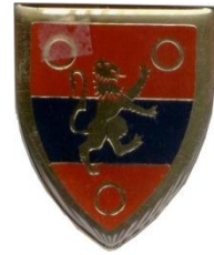
3 FIELD ENGINEER SQUADRON