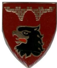
44 PARACHUTE BRIGADE, ENGINEERING SQUADRON