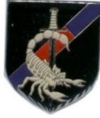
Beret badge SPECIAL OPERATIONS BRIGADE ENGINEERS