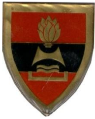
2 FIELD ENGINEER REGIMENT