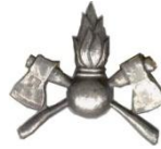
SOUTH WEST AFRICA ENGINEERS CORPS collar badge