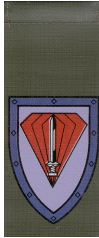
COMBAT ENGINEERS DIAMOND- YAHALAM TAG