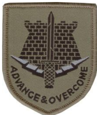
Combat engineer formation badge

COMBAT ENGINEER: gold colour : the sterling qualities of the Engineers, namely their steadfast spirit and durable nature; black colour: our ability to provide continuous support throughout hours of darkness; Castle: the solid construction power of the Engineers as seen in the bridges, fortifications, roads and obstacles often built by them. The interlocking bricks show the strength, endurance and high degree of teamwork required to accomplish engineer tasks; Bayonet: offensive spirit of the Engineers in piercing the enemy defences; twin bolts of lightning: destructive demolition power of the Engineers