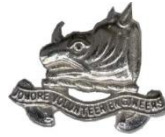
JOHORE VOLUNTEER ENGINEERS (was in existence before the Federation of Malaysia)