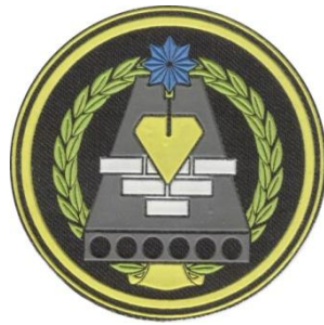
ВОЕННЫЕ ИНЖ. СТРОИТ. ФОРМИРОВ BUILDING ENGINEER TROOPS