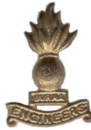
ENGINEER cap badge