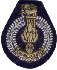
COMBAT ENGINEERS OFFICERS HAT BADGE