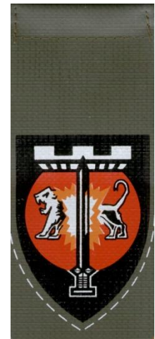
CENTRAL COMMAND ENGINEERS TAG