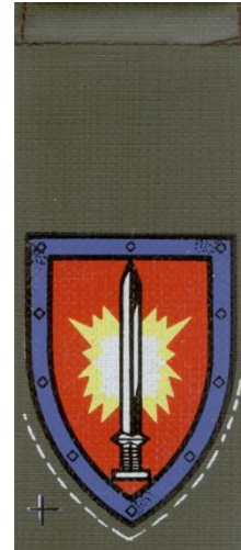
COMBAT ENGINEERS HQ TAG