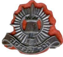
HEIL HANDASA ENGINEER CORPS BERET BADGE