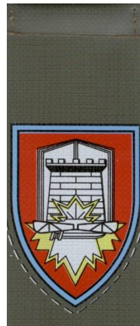
COMBAT ENGINEERS SCHOOL TAG