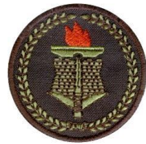
Combat engineer patch