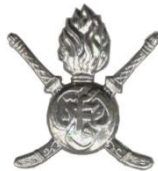
OMAN ENGINEERS cap badge in chrome