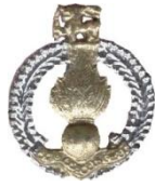
COMBAT ENGINEERS BERET BADGE