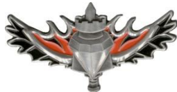
DIAMOND SPECIAL COMBAT ENGINEERS UNIT