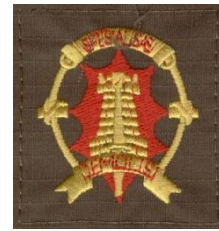
DEMOLITION SPECIALIZATION issued at the Special Forces Training Center