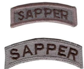
SAPPER TAB SAPPER TAB AFGHANISTAN