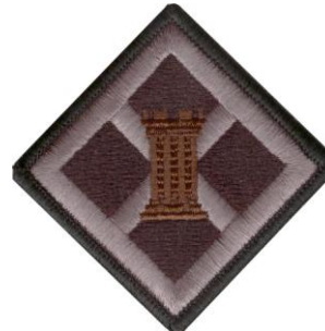
926 ENG BDE