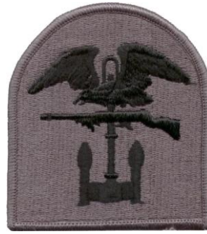
1 ENG BDE