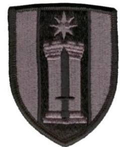
372 ENG BDE