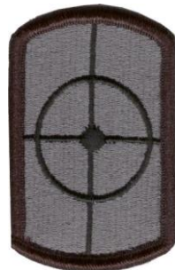
420 ENG BDE