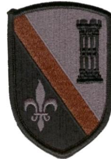
225 ENG BDE