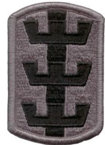
130 ENG BDE