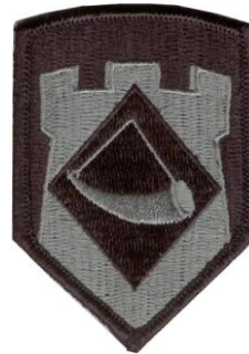
111 ENG BDE