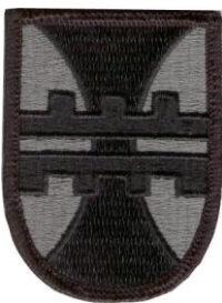
US ARMY 412 ENG COMMAND