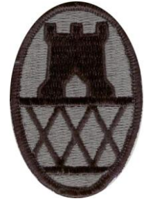
30 ENG BDE