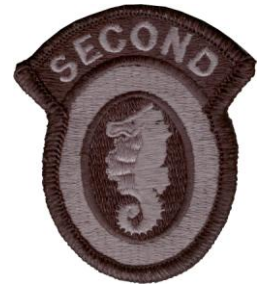
2 ENG BDE