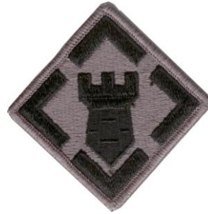
20 ENG BDE