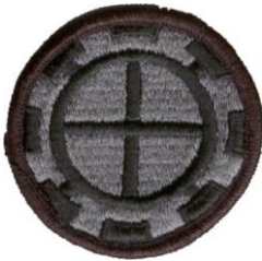
35 ENG BDE