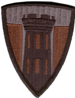
176 ENG BDE