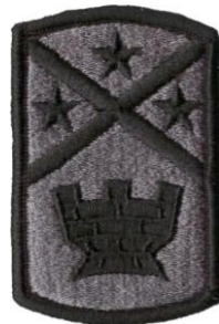
194 ENG BDE