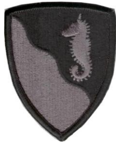
36 ENG GP