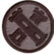
16 ENG BDE