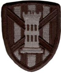
7 ENG BDE